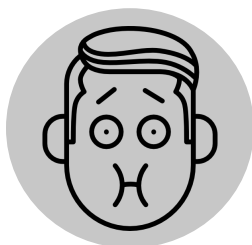
Nausea and Vomiting