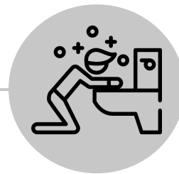
Nausea and Vomiting