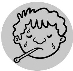
Fever and Chills