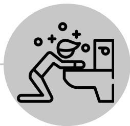
Nausea and Vomiting