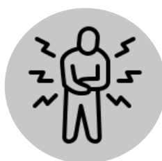
Head and Body Aches