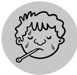
Fever and Chills