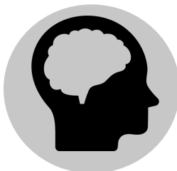
Inflammation of the Brain