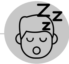
Feeling Very Tired