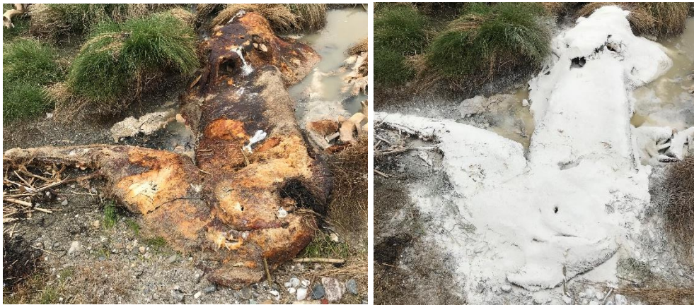
Figure 1. Photos showing carcass before and after covering with lime.

Background: Animal carcasses that pose a physical, health or safety hazard should be removed and disposed of in an appropriate manner. Carcasses which may be associated with distemper, avian influenza or other potentially contagious diseases, should receive special consideration to avoid unreasonable contamination or exposure to humans or pets. The preferred method for carcass disposal is composting but shallow burial may be appropriate in certain cases. Additionally, in special cases where the carcass is hard to reach or extract, agricultural lime may be applied over the external surface of the carcass to help suppress odors, flies and to discourage scavenging animals as it decomposes (see Figure 1). Lime may need to be re-applied as it washes away. Animal carcasses should never be disposed of in trash cans or dumpsters. Appropriate disposal may be employed as outlined below.